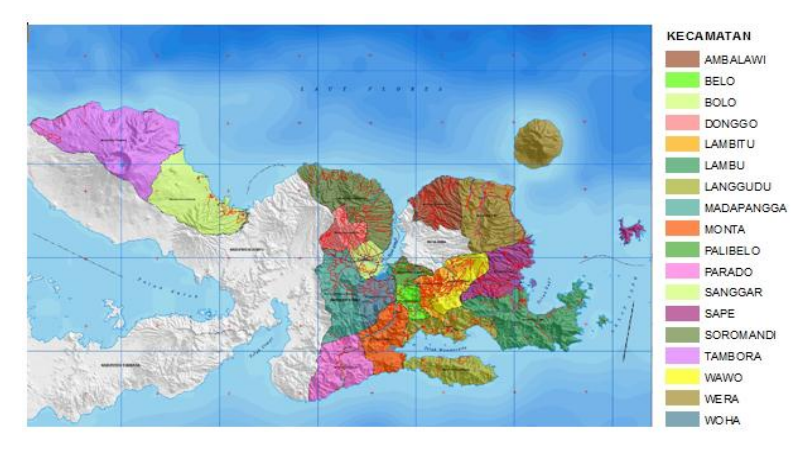
Figure 1. Bima Regency Administration Map

Regency, West Nusa Tenggara Province, the location was very strategic in looking at case studies and problems that occur. The following picture is a map of the research location;